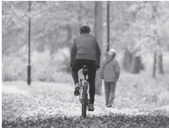
Proper exercise can have a positive effect on back health.

Maintaining muscle tone is important to back health. 1 It can reduce pressure in spinal joints, stabilize the spine, and keep it aligned. Exercise stimulates the body's natural endorphins, which are chemicals that can reduce pain. Exercise can also promote metabolic activity, increase healing, and prevent further injury.