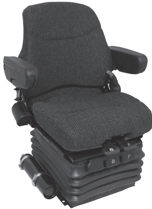
An ergonomically-designed tractor seat can reduce back stress.

Most newer-model tractors and farm equipment are supplied with well-designed, supportive, anti-vibration seats, complete with armrests. Older equipment is often lacking in terms of such seating. They may have unpadded or thinly-padded steel seats with no