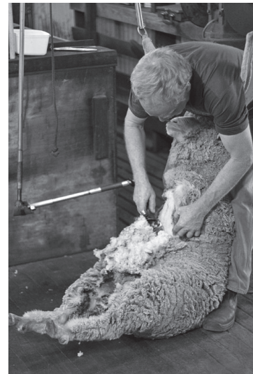
Many types of equipment can reduce the strain of animal handling.