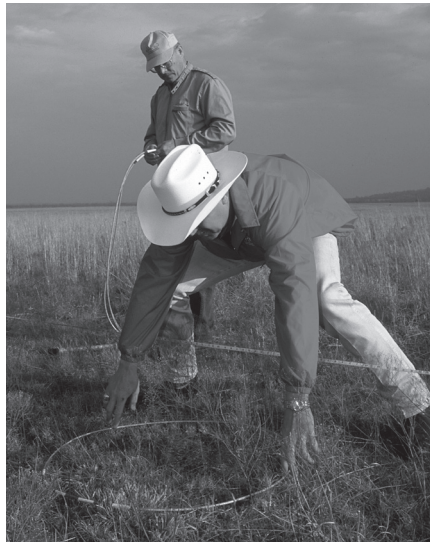
Awkward working postures can increase back strain.