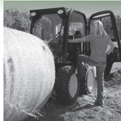
Equipment such as skid-steer loaders can be used to significantly reduce back strain.

Mechanical lifting devices should be used to move heavy, awkward, and irregularly shaped objects. Powered lifts, cranes and chain hoists can be used. Hydraulic and electric bed hoists for trucks and utility vehicles are widely available. Ramps can be used when loading equipment or materials onto a truck.