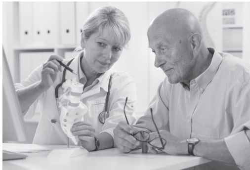
Health care providers may recommend a variety of treatments for back problems.