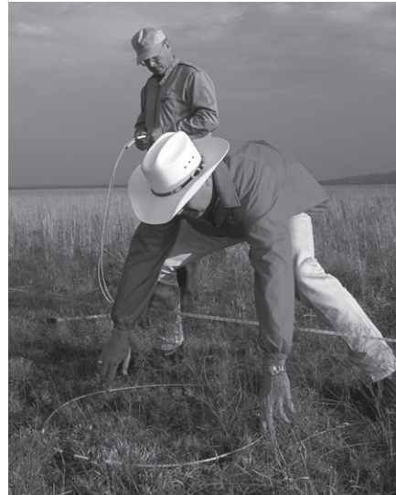
Awkward working postures can increase back strain.