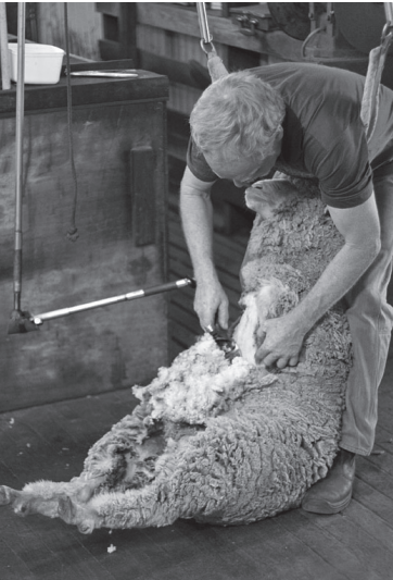
Many types of equipment can reduce the strain of animal handling.