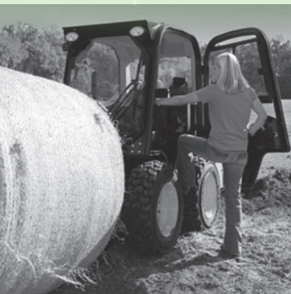
Equipment such as skid-steer loaders can be used to significantly reduce back strain.

A skid-steer loader, utility vehicle, or ATV may be used to perform many tasks otherwise carried out by hand. Attachments are available for moving bulk material, lifting pallets and bales, drilling post holes, mixing concrete, moving snow, etc.