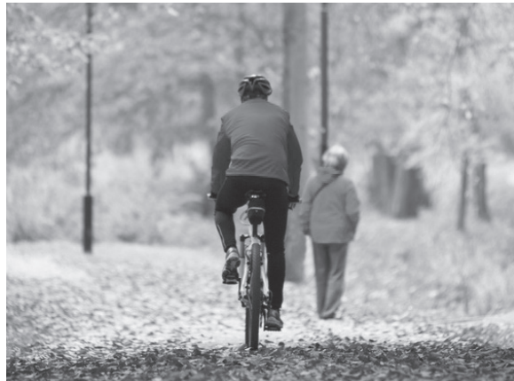
Proper exercise can have a positive effect on back health.

Maintaining muscle tone is important to back health. 16 It can reduce pressure in spinal joints, stabilize the spine, and keep it aligned. Exercise stimulates the body's natural endorphins, which are chemicals that can reduce pain. Exercise can also promote metabolic activity, increase healing, and prevent further injury.