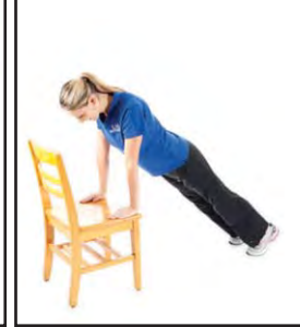
Figure 29 Level 2