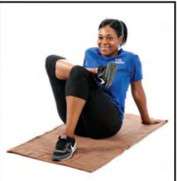
Figure 37 Level 2